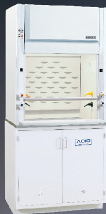
UniFlow CE AirStream