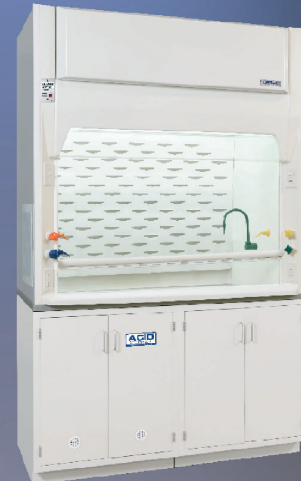
UniFlow SE AireStream High Performance Energy Efficient Laboratory Fume Hoods