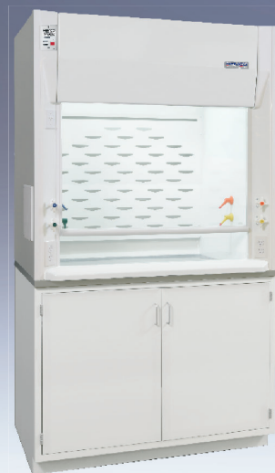
UniFlow LE AirStream