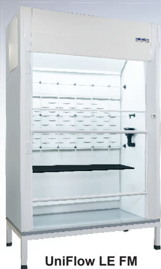
UniFlow LE FM